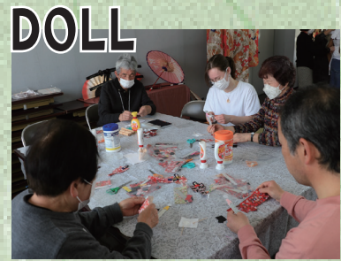
Japanese paper doll